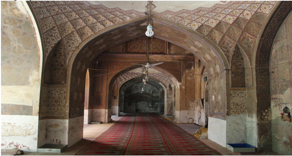
Fig 2. View of the long prayer hall showing flower twigs, interwoven floral tracery on the niches that flow in and out of the domes breaking monotony of the solid structure engulfing the viewer into a spiritual stance.