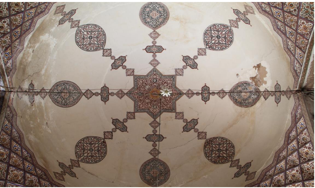
Fig 4. Inner side of the dome of the prayer hall. Motifs initiating and culminating from the center or dot.