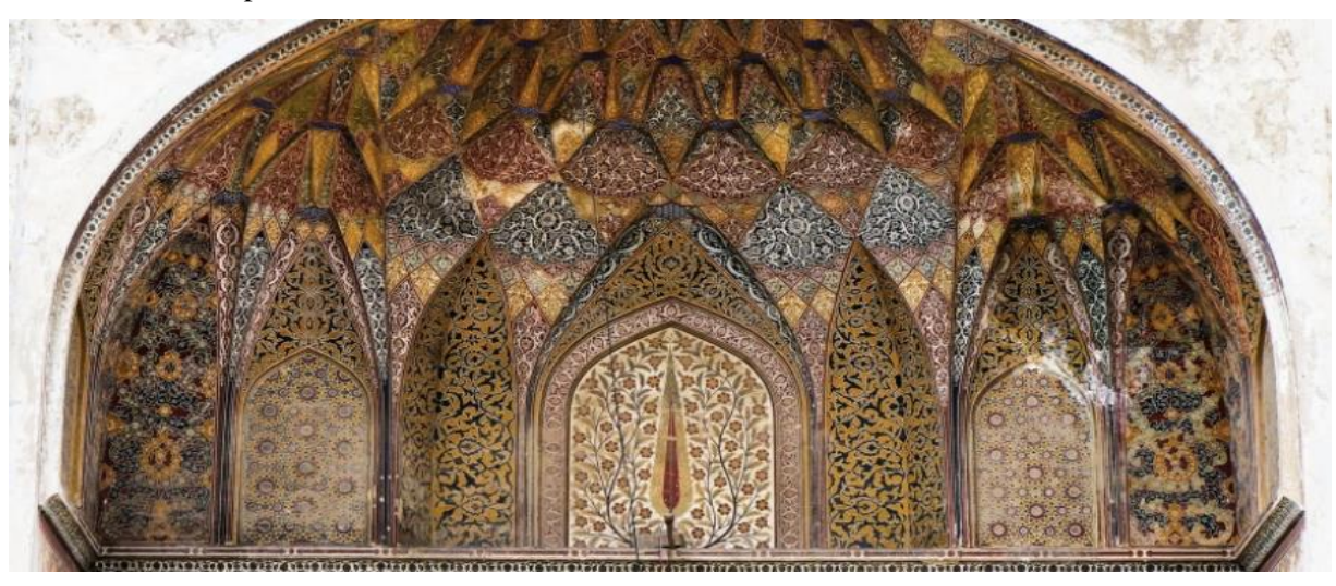
Fig 3. Facade of the Prayer-hall (Detail) Fresco painting adorning the soffit of the arch exhibiting cypress tree and other floral motifs

'Loosing oneself' in the contemplation of the works of art facilitates such a journey so do the carefully chosen icons and motifs. For example, the evergreen cypress tree is (Fig 3) known for signifying eternity. Arabs called it the Shajarat-al-Hayya or Tree of Life. To the Persians, it held religious significance as a symbol of Ahur Mazda - the creator and highest deity of Zoroastrianism. In other instances, namely Persian romantic poetry and book illustrations it stands for peace, stability, strength, goodness even the longing of the lovers (Dehkordi, 2017. In the case of Mariam Zamani mosque, it can be translated as all above mainly adding onto the devoted idea of ornamentation to portray eternity and the love and longing for God Himself. The popular mystic Islam in the Subcontinent propagated ideas like spiritual unification with the Creator and was later referred to as Ishq e- Haqiqi in Urdu poetic and literary traditions.