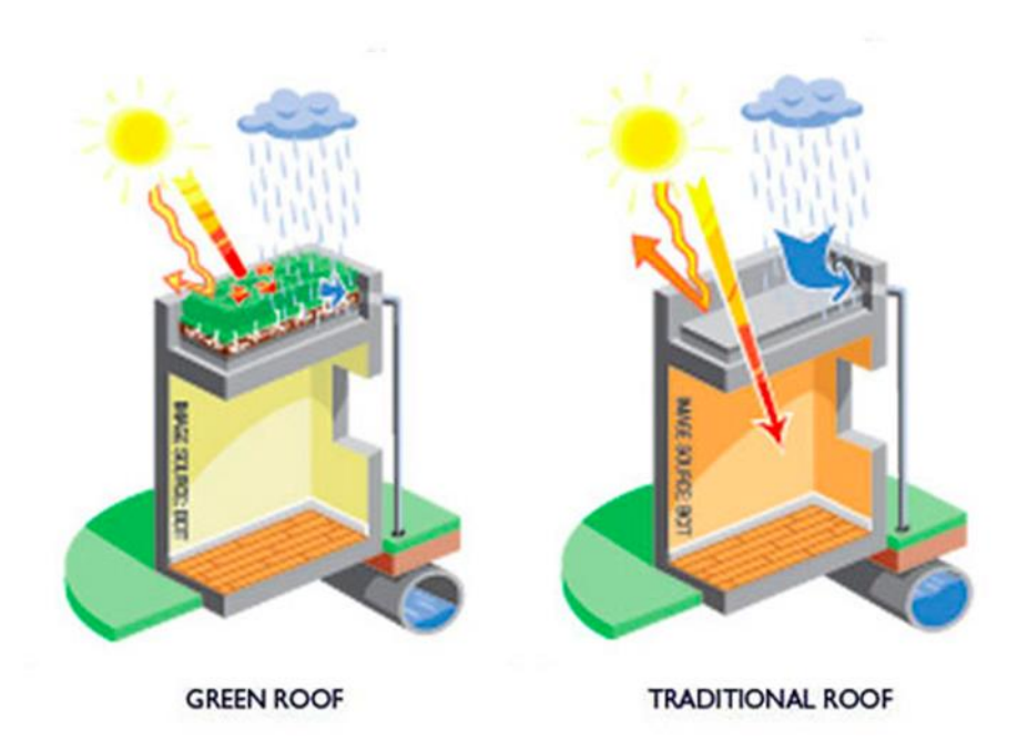
Figure 2: Green roof vs. conventional roof

Urban centers have a greater temperature due to the urban heat island effect (UHIE) implying that cooling your home will cost more throughout the summer. Green roofs serve as a barrier to insulate buildings by preventing the entry of either warm or cold air. Buildings can benefit from the enhanced value of the property, longer roof life,local reward and reward schemes as a result of using less energy to heat and cool them. The majority of home and company owners who install green roofs do so on a variety of grounds. The city reaps the benefits of needing less stormwater runoff infrastructure. According to Zhang & He (2021), the installation of substantial green roofs on a city-wide scale might reduce the expense of stormwater drainage equipment by up to 70%.